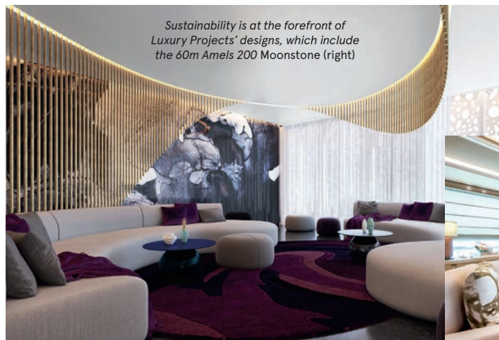
Sustainability is at the forefront of Luxury Projects' designs, which include the 60m Amels 200 Moonstone (right)

Winch Design is currently working on 16 yacht projects. winchdesign.com