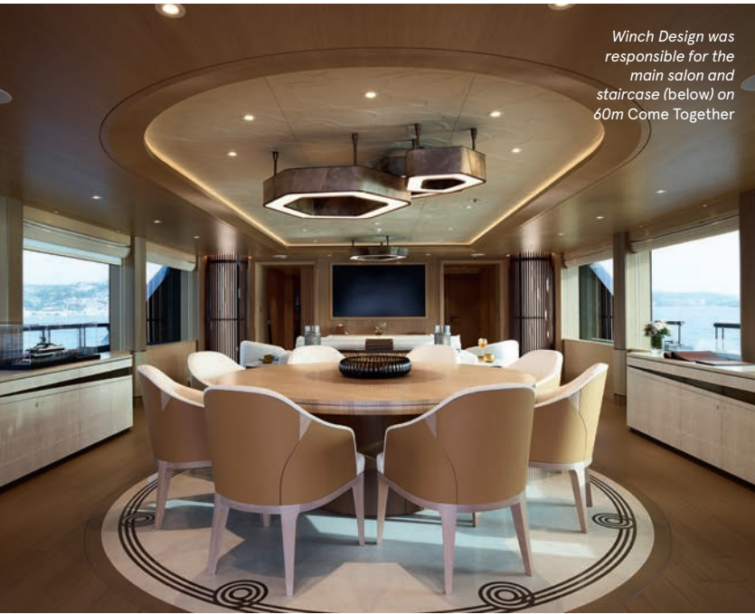
Winch Design was responsible for the main salon and staircase (below) on 60m Come Together