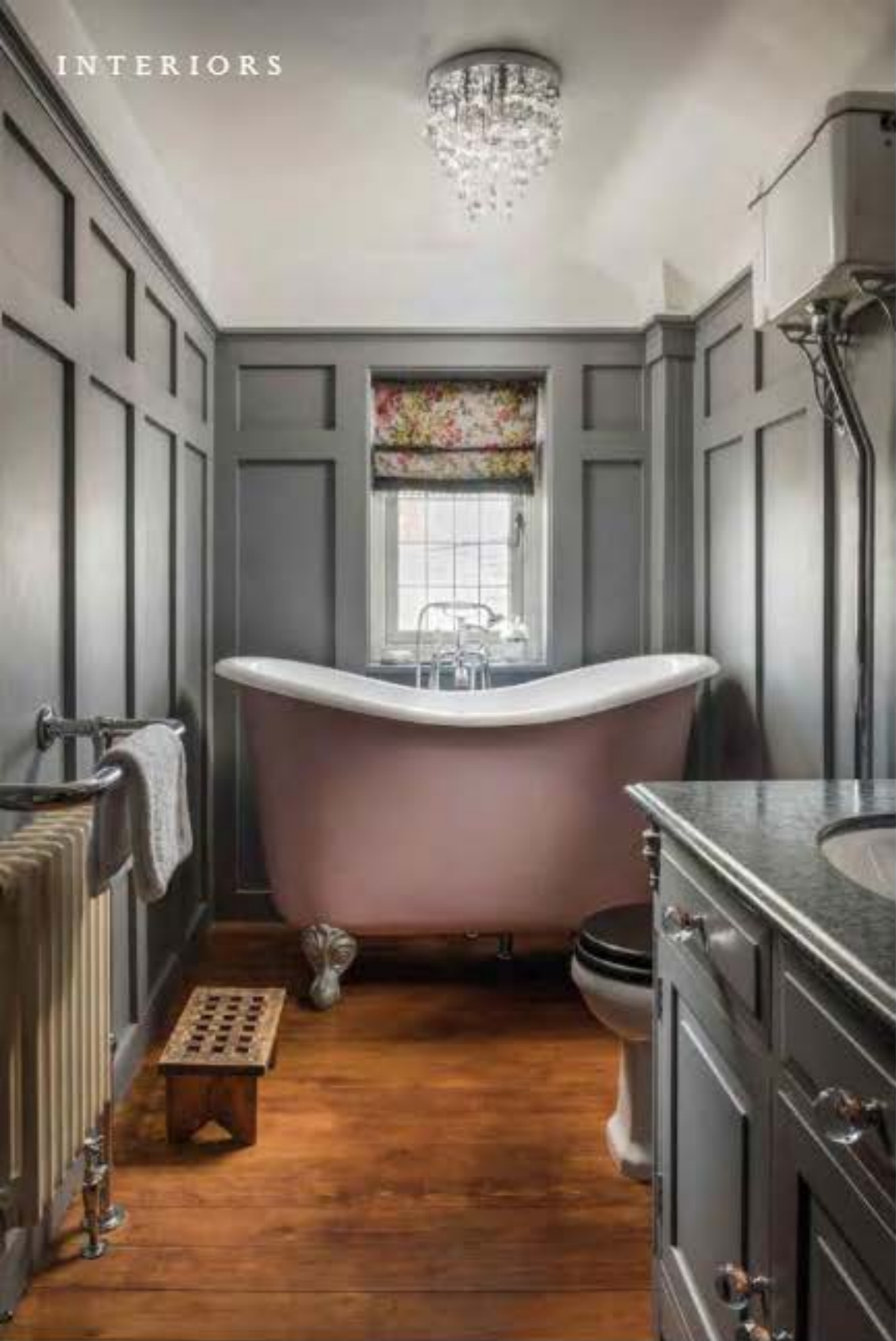
BIJOU BATHROOMS Clockwise from left: Tubby Too roll top bath, Albion Bath Company; A West One Bathrooms design westonebathrooms.com; Tubby Too bath in gold albianbathco.com