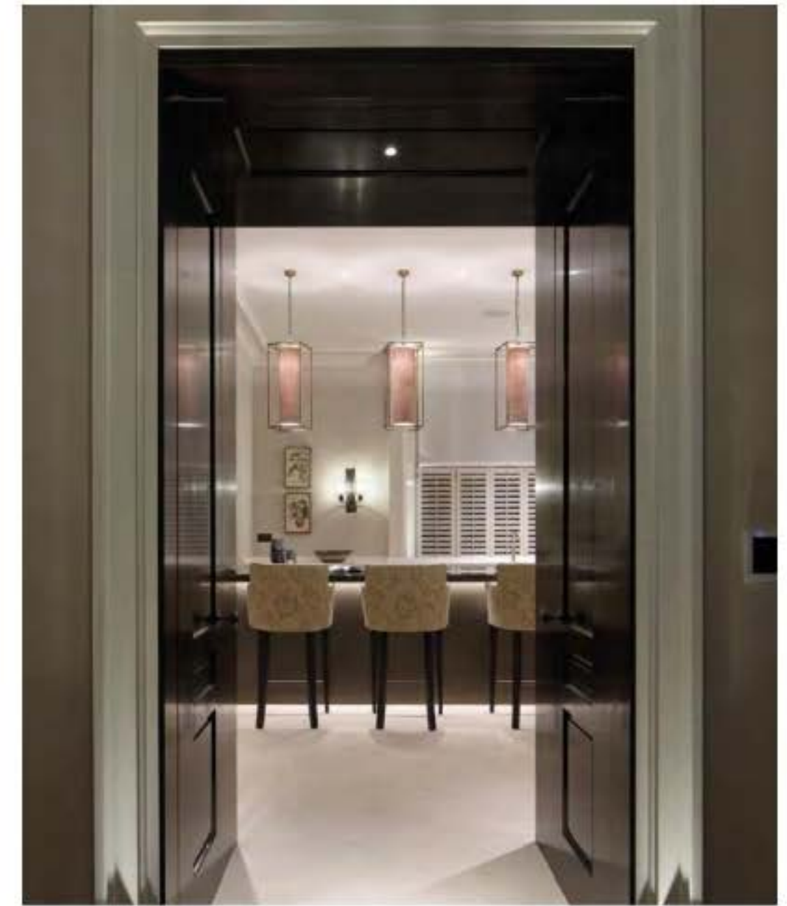
CLEVER STYLING Left: The Vivienne modular sofa, £6995, and Wallace burl coffee table, £795, by Soho Home, sohohome.com . Above: A door frame is softly uplit, johncullenlighting.com