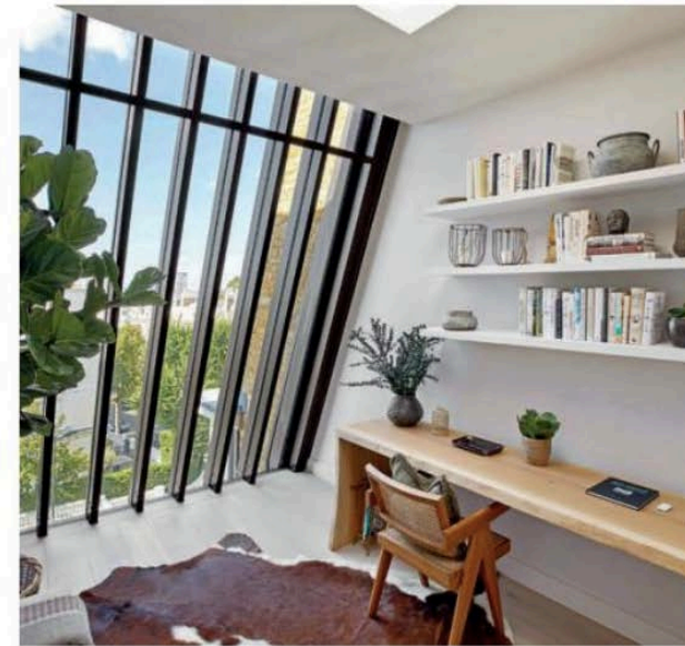
Left, below and opposite: the creative glazing in this new build home respects the surrounding Victorian architecture Bottom: a large expanse of glazing over the gable end allows this barn conversion to really make the most of its views