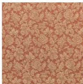
'HERITAGE DAMASK' (brick), cotton mix, £85, from Ralph Lauren Home. ralphlauren.co.uk