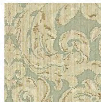
'BROCATELLO' (light blue), cotton/linen, £109, from Zoffany. sanderson designgroup.com/zoffany