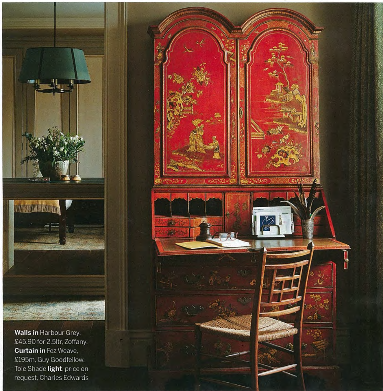
Walls in Harbour Grey, £45.90 for 2.5ltr, Zoffany. Curtain in Fez Weave, £195m, Guy Goodfellow. Tole Shade light, price on request, Charles Edwards