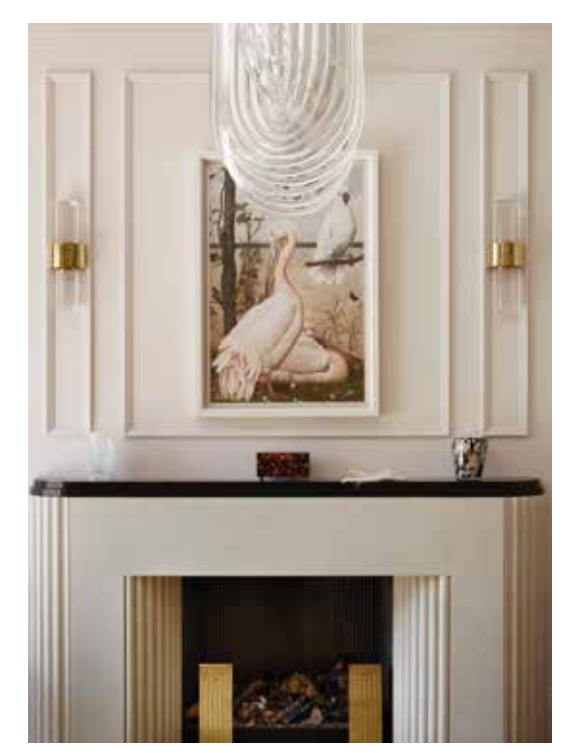
A lime rug injects a dynamic energy to the elegant sitting area; gilded detailing on wall sconces and other decorative accents draw reference to the home's tribute to the Jazz Age

To achieve this remarkable mix, the couple employed the skills of Studio Indigo, a multidisciplinary design practice which is well-versed in the architectural and decorative transformation of London's most luxurious homes. The owners weren't terribly fussed either about the time that it might take to achieve their dream home and thus a three year renovation began.