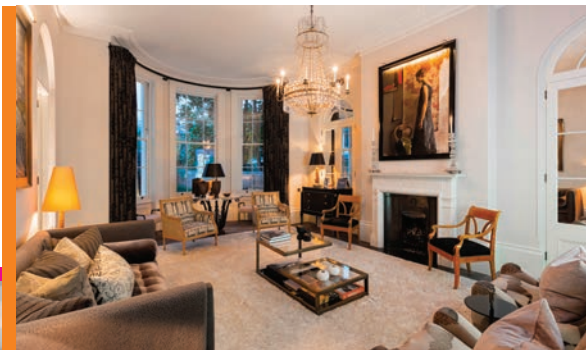
The floor of the entrance hall, left, uses the same limestone as Chatsworth House. The living room, right, the bathtub in the master ensuite is by Water Monopoly, above; the £170,000 vellum dressing room, top right

The lacquered ebony chest is a decadent piece of deco – "Lutyns said every room should have a bit of black in it." But it's the all-white dressing room that oozes golden-age glamour. Fashioned from vellum, for £170,000, the streamlined oval space evokes a 1930s perfume ad. The fantasy film set continues on the lower ground floor: a 42ft pool tiled in slate, with silver streaks that sparkle like diamonds, and nymphlike statues emerging from the water. Instead of a ladder, he put in a staircase, "so that my dogs could walk into the pool." Next door, the media room is notable for its floral fabric stag's heads from South Africa. Fisher may be British-born, but considers South Africa his adopted home; he spends a couple of months there every year. Otherwise, he's a rolling stone: he's lived in 20 houses in the past 20 years, and attributes this restlessness to his army father, who moved the family every two years. "I don't get emotionally attached to my house. And as a designer, I start to see faults in the houses I do for myself. And the only way to fix those faults is to start again." It's hard to imagine a fault in this dream pad, but he's found one: "The entrance hall is so grand, you expect the rest of the house to be even bigger, so I suppose there's a disappointment in the rooms beyond."