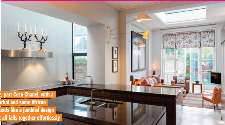
Part John Soane, part Coco Chanel, with a hint of Andy Warhol and some African exoticism, it sounds like a jumbled design museum, but it all falls together effortlessly